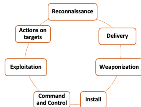
Fig. 2 A Cyber Kill Chain model advanced attack stages.

The CKC model comprises the following stages [15] as shown in Fig. 2: