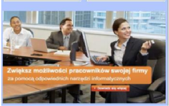
Fig. 5 Forged Image