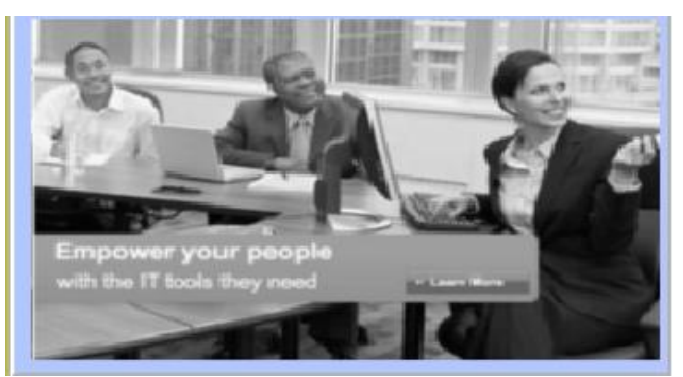
Fig. 3 Gray Scale image