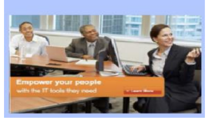
Fig. 2 Original image