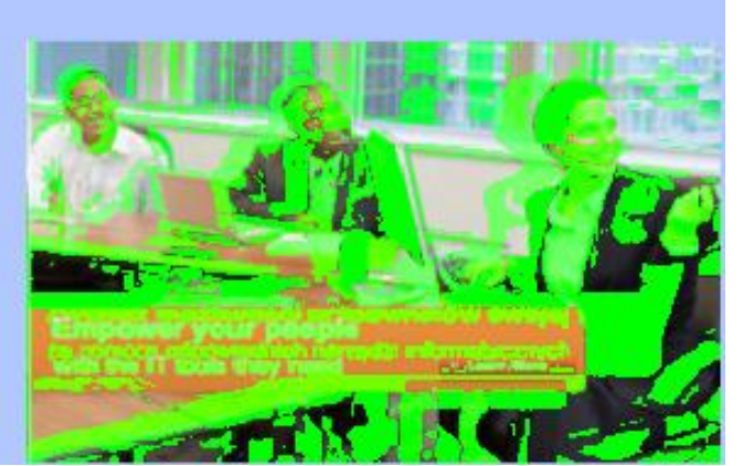
Fig. 6 Detection of forged region

Fig.2 is an original image which is taken from dataset. Next is conversion of RGB image into gray scale image as shown in fig. 3 for discarding unnecessary information. After that, segmentation is done in fig. 4 for represent the image in a meaningful information and easy for analyzing it. Forged image is selected from dataset in fig. 5 and detection of forged region is shown in fig. 6.