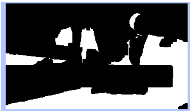
Fig 4 Segmented image