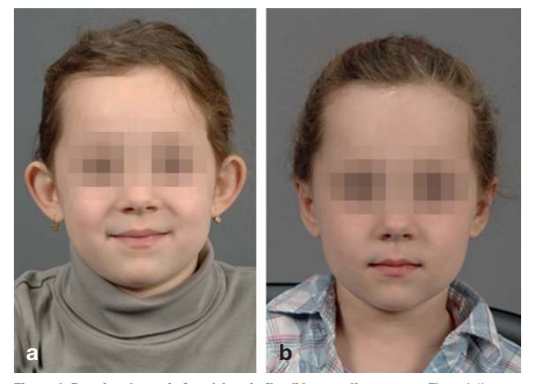
Figure 1: Prominent ears before (a) and after (b) corrective surgery. Through the use of a suture-only technique with appropriate modern suture materials, the cartilage framework of the external ear is maximally spared greatly reducing the risk of post-operative complications and deformities (surgeons T. Braun and J. M. Hempel)