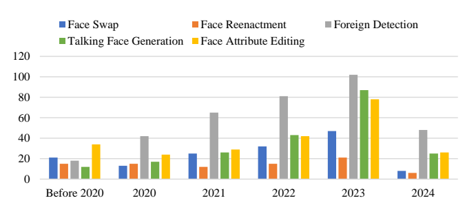
Fig. 4: Works summarization on different directions per year. Data is obtained on 2024/03/26.