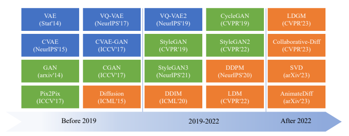
Fig. 3: Development timeline of three mainstream generative modals, i.e. , VAE, GAN, and Diffusion.

images. LDM [25] is more flexible and powerful when it comes to modeling complex data distributions. In the field of video generation, Diffusion models play a crucial role [49], [50]. SVD [7] fine-tunes the base model using an image-to-video conversion task based on text-to-video models. AnimateDiff [8] attaches a newly initialized motion modeling module to a frozen text-to-image model and trains it in subsequent video clips to refine reasonable motion prior knowledge, thus achieving excellent generation results.