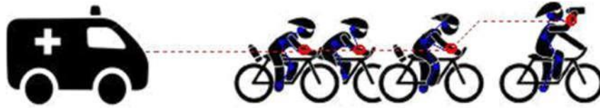
Figure 1: Body-to-Body Network for U-Health monitoring of a group of cyclists.

A. BBN concept: A Body-to-Body Network (BBN) is composed by several WBANs, each communicates with its neighbor. The coordinator device plays the role of a gateway that shares the communication data with other WBANs. Body-to-Body Network is theoretically a mesh network that uses people to transmit data within a limited geographic area. Using devices such as a BBN-enabled Smartphones or Smartwatches, a signal is sent from the WBAN to the nearest BBN user, which is transmitted to the next-nearest BBN user and so on until it reaches the destination. Figure 1 illustrates an example of BBN network used for the U-Health monitoring of a group of cyclists.