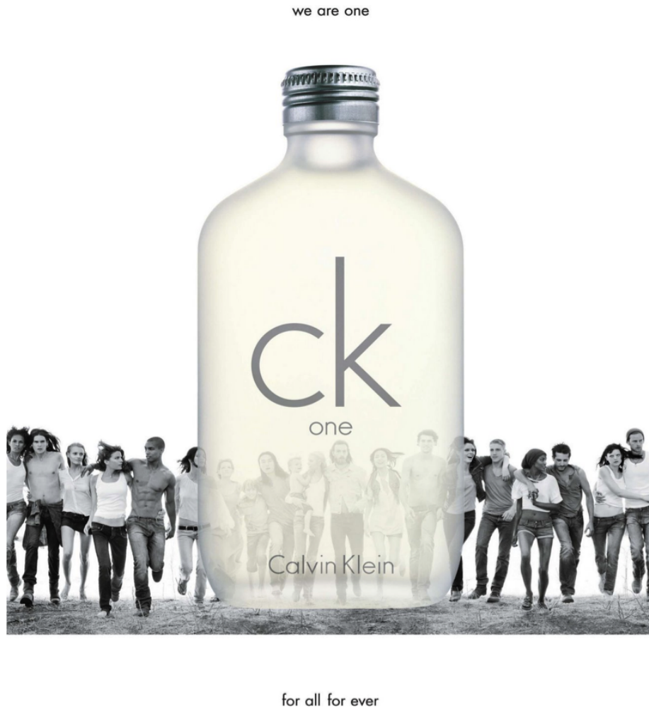
Fig. 1: ck one by Calvin Klein. Advertisement. Rolling Stone Mar. 5 2009: 11.

Calvin Klein's ck one brand existed for years before Barack Obama was elected president, always marketed as "a fragrance for a man or a woman." But the company used the occasion of his election, and his theme of inclusiveness, to re-launch its product. The slogan of the new advertisements declared "we are one for all for ever" (Figure 1).