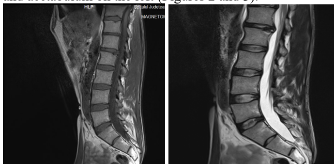
Figure 1: Sagittal cross-section MRI images of the lumbar spine, T2 and T1 weighted.

MRI examination of the pelvic region revealed edema of the left internal obturator muscle, marked edema and partial tearing of the external obturator muscle and a thin fluid collection along the upper border of the external obturator muscle, the head and neck of the femoral bone (Figure 2). There was also asymmetry regarding the piriformis muscle with contracture on the left side (Figure 3). MRI also showed diffuse edema of the femoral head and acetabulum on the left (Figures 2 and 3).