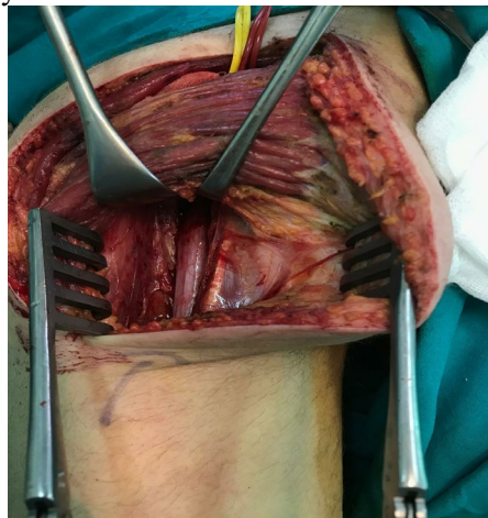
Figure 4: Intraoperative aspect of the left sciatic nerve after the debridement of the scar tissue.

Surgical debridement of the scar tissue was performed (Figure 4). An epidural catheter with continuous administration of anesthetic was placed for 48 hours after the surgery.