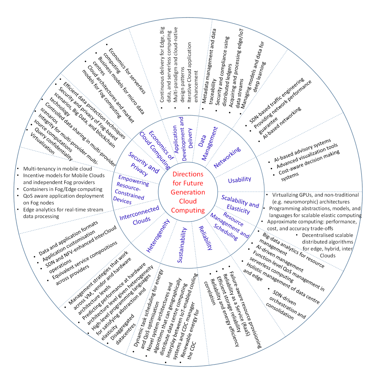
Figure 3: Future research directions in the Cloud computing horizon