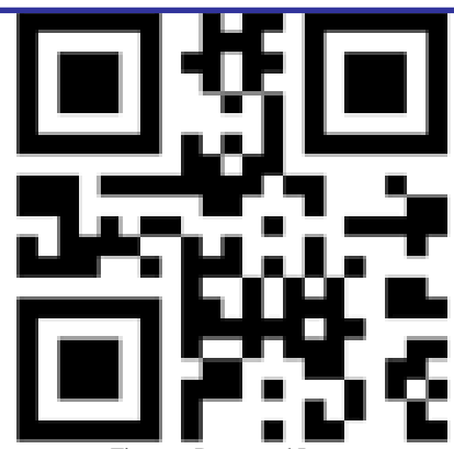
Fig. 6. Decrypted Image