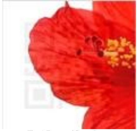
Fig. 5. Encrypted Secret Image