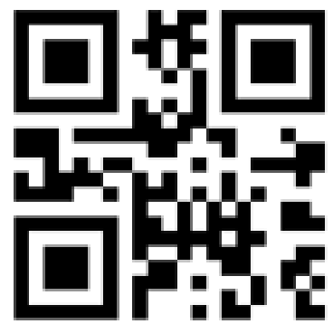
Fig. 3. QR Secret Image