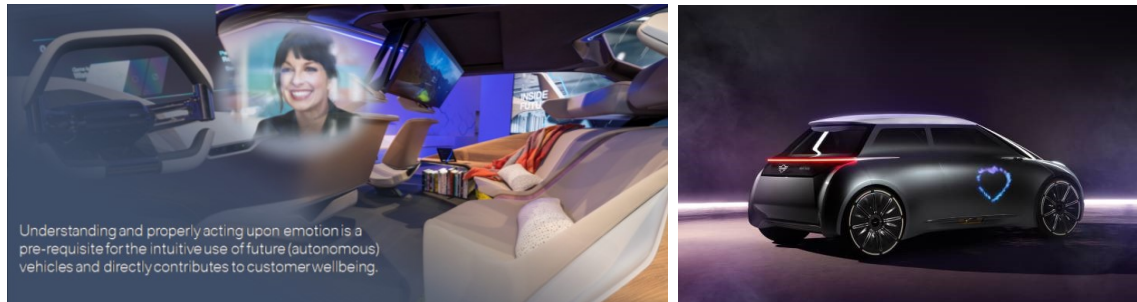
Figure 1. Emotion awareness: crucial for vehicle interaction with passengers and road users.

Susanne Müller Coaching & Consulting kontakt@susamueller.de