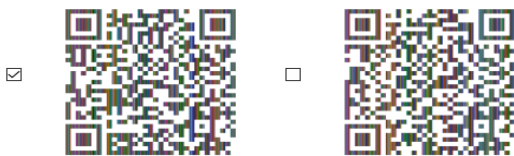
Fig 4. Secrets generated at sender side