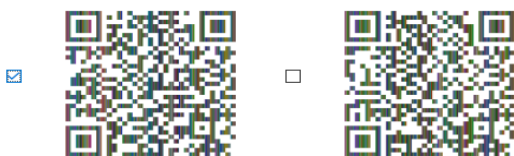
Fig 5. Secrets generated at receiver side.