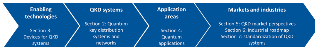
Figure 1. Review structure. Note: QKD = quantum key distribution.

The efforts made in quantum technologies have increased rapidly in recent years, and the number of filed patents and publications have increased together with the number of proposed projects. However, the impact of such technologies on the market remains limited. The reasons for this are several barriers preventing industrial transfer, both technological and related to perception from the industry. Here, we draw a link between existing technologies, protocols, and devices with potential industrial markets, as an attempt to identify where and how quantum technologies may impact relevant market segments. Covered aspects, ranging from enabling technology to market considerations, are illustrated in Figure 1.