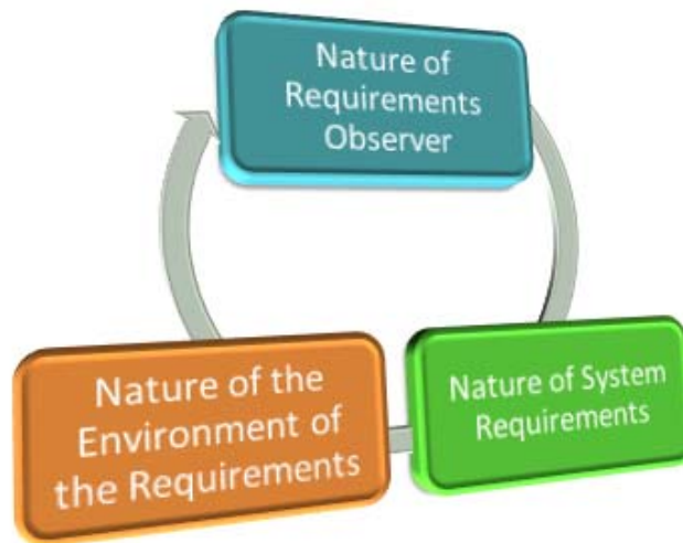
Figure 2 Framework for addressing complex system requirements (see online version for colours)

It has been suggested that true system requirements will exist independent of the observer due of biases, predispositions, and paradigms (Sousa-Poza and Correa-Martinez, 2005; Ghoshal, 2005; Sousa-Poza, 2008). Therefore, this paper suggests that the elicitation of true system requirements cannot depend on the system observer alone. The nature of requirements and the dynamic environment must be considered. The proposed framework is intended to capture infrastructure requirements from three different perspectives.