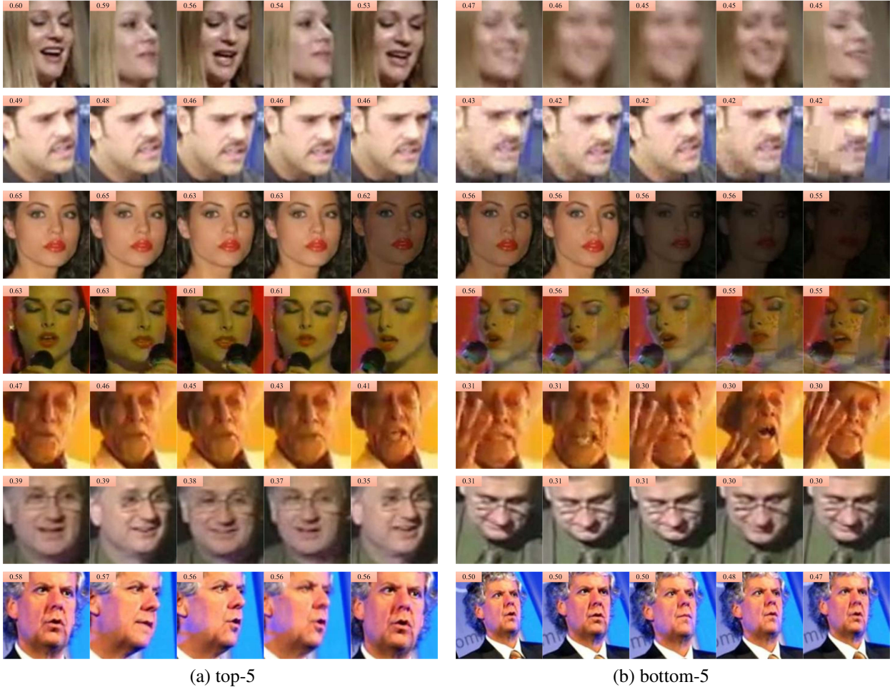
Figure 3. We sort the frames within a sequence in a descending order with respect to the discriminator-guided weights ( \mathcal{D}(y = 1|v) ), and display them by showing the top-5 and bottom-5 instances, respectively. The weights are shown in the upper-left corner of each frame. We visualize eight video sequences that illustrate the following video quality degradation: blurring , compression noise , lighting variation , video shot-cut , occlusion , detection failure , pose variation and mis-alignment from the first to the last row.

preprocessing. By removing poor quality images based on localization errors, we obtain much higher verification and identification results. However, the gap between our proposed model and the baseline is reduced, which we believe is due to low-quality images being mostly filtered out, so the baseline method can still work fine or even better. Compared to previous works, the performance of our proposed method is competitive under similar training and testing protocols [34, 1]. Further improvement is expected by training a stronger base network on larger labeled image datasets [39] or with other types of synthetic data augmentations such as pose variation with 3D synthesization [23].