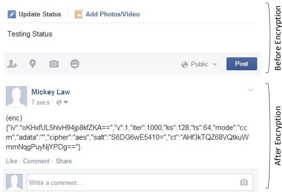
Figure 2. Status update message before and after encryption

encrypted value is displayed to the user. A point to note is that on the next page refresh or after a certain amount of time, the encrypted status will be displayed to user as plaintext as shown in Figure 3.