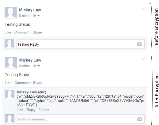
Figure 3. Comments before and after encryption

Figure 3 also shows that when a user comments on a status update, message or an image, the add-on interrupts the data and encrypts it.