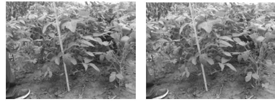
Figure 3. Original stereo images of soybean