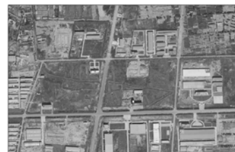
(a) Orthoimage on Feb. 2010

Figure 1 shows the example of change detection in crop field in the way of remote sensing images. The data acquired from Quick Bird locating some place in Shanxi Province. Figure 1a is taken on Feb. 2010, Figure 1b is taken on the same season next year. After ortho-rectification and comparison, the changing regions could be clearly detected in crop fields (see the white-color regions in figure 1c).