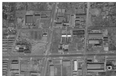
(b) Orthoimage on Feb. 2011