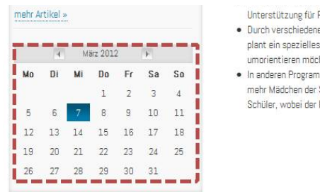
Figure 3: Calendar widget properly rendered in the reference browser. WEBMATE highlights the correct boundaries of the widget to make comparison easier for the developer.