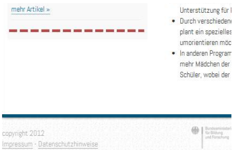
Figure 4: In one of the x-browsers, the calendar widget is rendered in principle, but with a height of 0. Here, WEBMATE draws a line to indicate the invisible widget's position.

quality we avoid to report consequential errors. For instance, if a container element is misplaced, all the contained child elements would be misplaced as well. Therefore, before we check those child elements, we normalize their position relatively to the parent container; only then, we compare the relative positions of each child.