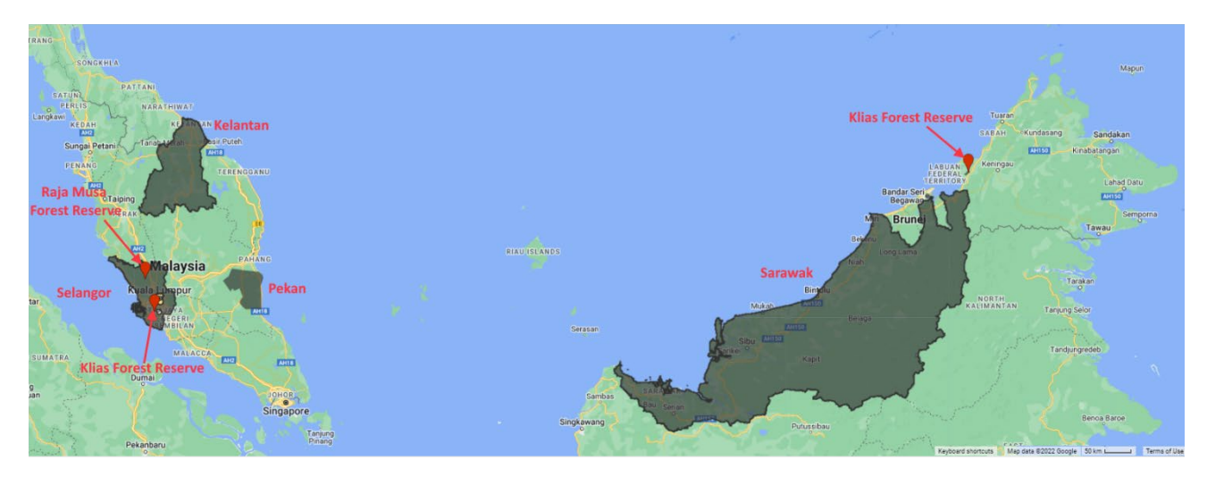
Figure 1. Hotspot locations based on historical fire information from previous studies.