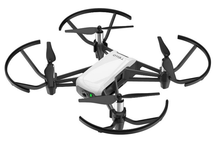
Figure 1 – Tello Drone

A university competition will take place after the high school competition. Participants will be racing against each other via time trials. The baseline drone model recommended for this competition is the Tello Drone as seen in Figure 1. As an added bonus, rubber duckies will be placed around the course at random for a bonus computer vision object recognition task. Teams will be allowed to choose their best run out of two. Plaques and cash prizes will be awarded to first, second, and third places.