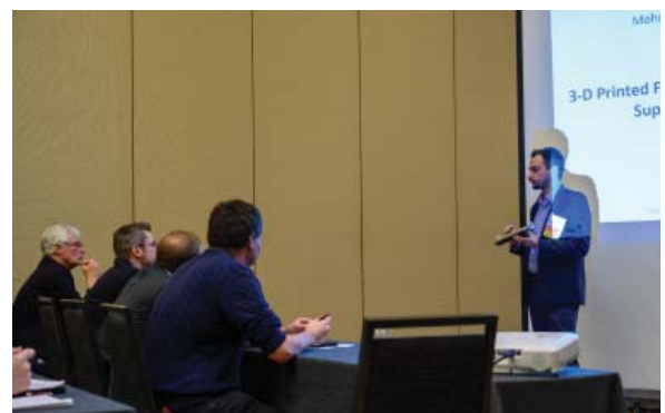
Student Finalist RWW2020