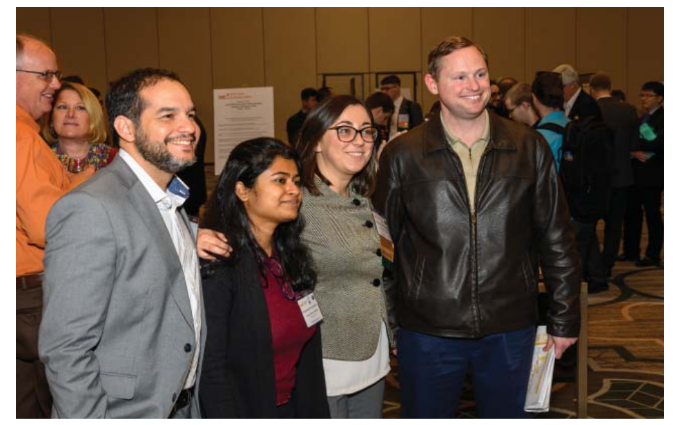
RWW 2020