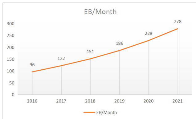
FIGURE 3. Annual monthly average statistics/forecast of global internet traffic.

With the rapid development of the emerging Internet industry, the booming application programs have led to the continuous growth of Internet traffic. According to the forecast [53], the total global IP traffic will triple between 2016 and 2021, from an annual average of 1.2ZB(96EB/ month) in 2016 to 3.3ZB(278EB/ month) in 2021. Figure 3 shows the statistics and forecast of the annual monthly average of global internet traffic. The proportion of video in Internet traffic will increase from 73 percent in 2016 to 82 percent, and it can be predicted that this proportion will increase year by year.