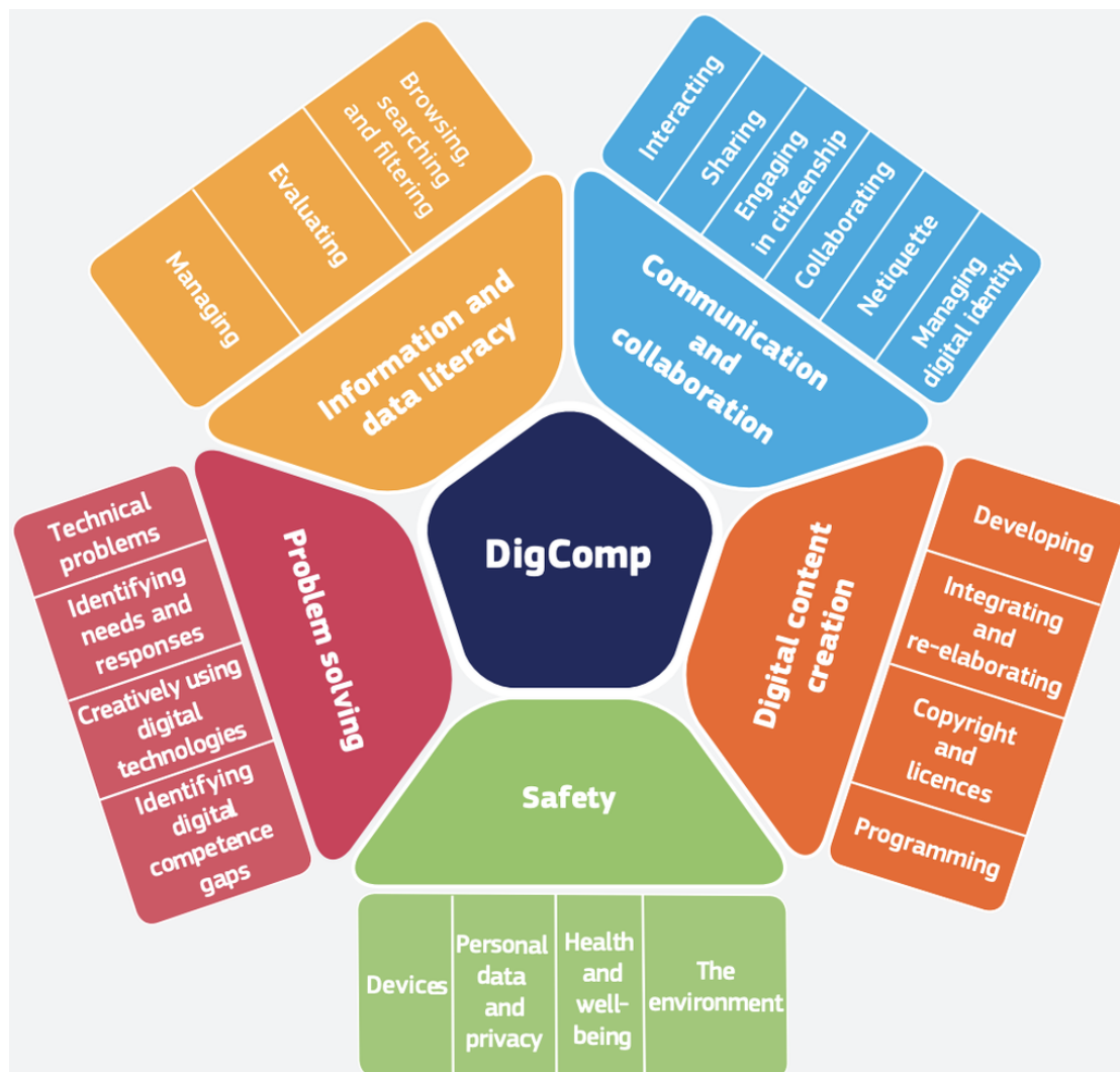
Figure 1: Five areas of digital competence

Observations of the digital levels manifestations of competence were carried out in the process of trial testing of the blended learning introduction in the masters industrial training in the field of sewing. Starting from 2018, students of the Vocational College of Oleksandr Dovzhenko Hlukhiv National Pedagogical University were offered distance learning courses-resources: “Fundamentals of clothing composition” (FCC), “History of costume design and material culture” (HCDMC), “Equipment and automatization of garment production” (EAGP), which were developed on the Moodle platform for blended learning.