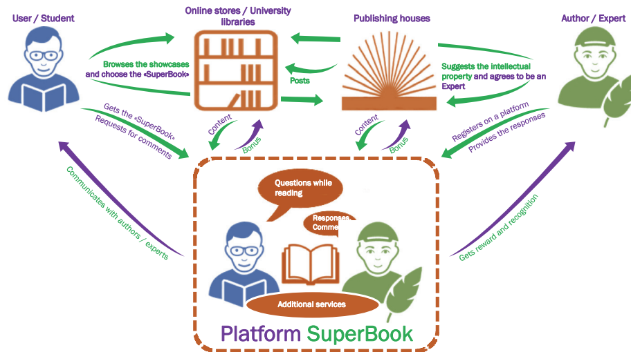
Fig 3 – SuperBook Digital Platform –External Site Content Aggregator

SuperBook, on the other hand, is a tool that allows participants to publish their own content and organize a constructive discussion. For example, a reader can upload an existing e-book to SuperBook, fill out a classifier for it, find experts to discuss issues on this book “in the margins” of electronic materials, and invite other interested readers to the discussion. If a platform participant acquires “intricate” knowledge, which should be manifested in the form of fixed professional skills (for example, sports training to achieve certain goals), he can create his own blog (training diary) and invite relevant experts to receive consultations in the context of his digital diary.