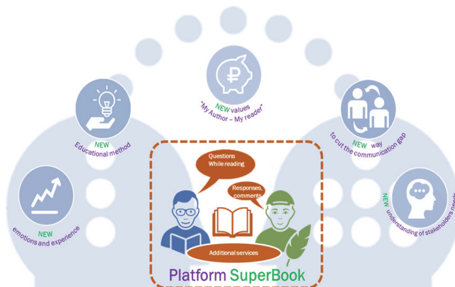
Fig 6 – SuperBook Digital Platform Effects

To achieve this goal, the authors have analyzed the needs of the audience, current trends in the field of Digital University, the possibility of obtaining finished materials from external sites, as well as the willingness of authors, experts and readers to use the proposed service. The creation of the approach was formed on the basis of the various needs and interests of all market participants. The authors made recommendations on the development of an innovative digital platform SuperBook, distributed through major mobile operators and other channels, with the support of external sites and educational structures, also with the agreement of the authors for enhanced communication with the audience.