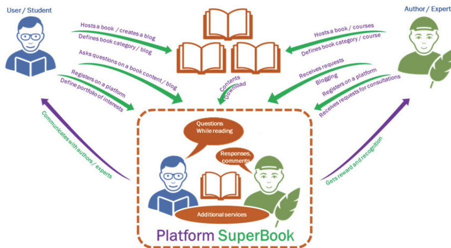
Fig 4 – The SuperBook Digital Platform–The Aggregator of Participants’ Own Content

SuperBook, on the other hand, is a tool that allows participants to publish their own content and organize a constructive discussion. For example, a reader can upload an existing e-book to SuperBook, fill out a classifier for it, find experts to discuss issues on this book “in the margins” of electronic materials, and invite other interested readers to the discussion. If a platform participant acquires “intricate” knowledge, which should be manifested in the form of fixed professional skills (for example, sports training to achieve certain goals), he can create his own blog (training diary) and invite relevant experts to receive consultations in the context of his digital diary.