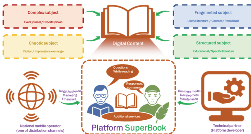
Fig 2 – General positioning of the digital platform SuperBook

The content provider and the consumer are not permanent roles. In the process of interaction, they can change among themselves, depending on whether a person posts his article or asks a question about the work (or book) of another participant of the platform.