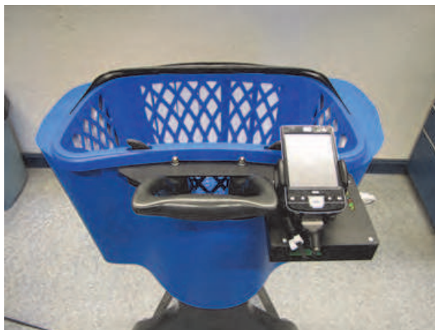
Fig. 6. Smart shopping cart

Let's see how these components have been implemented by the StoLPaN consortium.