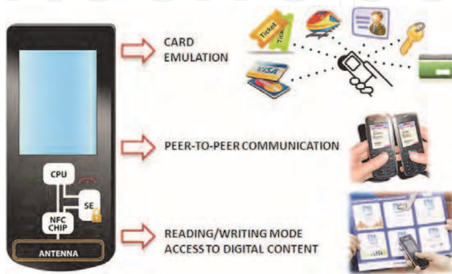
Fig. 1. NFC communication modes

As it enables several ways of use, NFC is a really adaptable technology. It can operate in three communication modes, based on three different types of interaction between the mobile phone and other NFC-enabled devices (Figure 1).