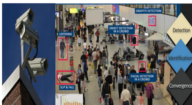
Fig. 6 Surveillance with Deep learning and AI

At current years, there are many hype of applied science and especially within the field of artificial intelligence. Inspiring the machines to find out from the information which are gathered from different source and build accurate decisions within the areas like in the field of education, in medical and healthcare industries, finance and etc. There are multiple applications which are the mix of each artificial intelligence and Deep Learning.