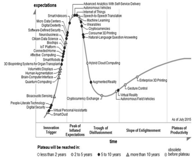
Fig 7. Gartner Hype Cycle 2015

"Deep Learning" isn't on the graph for the first time since 2015", on that time people do not motivated about the Deep learning technology(see figure 7). In the 2018 Garter hype Cycle for rising Technologies (see figure 8) the location of "Deep Learning" within the transition section is on the "Peak" whereby a lot of analysis focus is driving expectations from the sector on top of ever before and within the next decade it's expected to peak because the technology matures and analysis outcomes are reported from varied analysis teams [32].