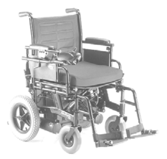
Figure 1: The Power Wheelchair (Invacare Nutron R-32).