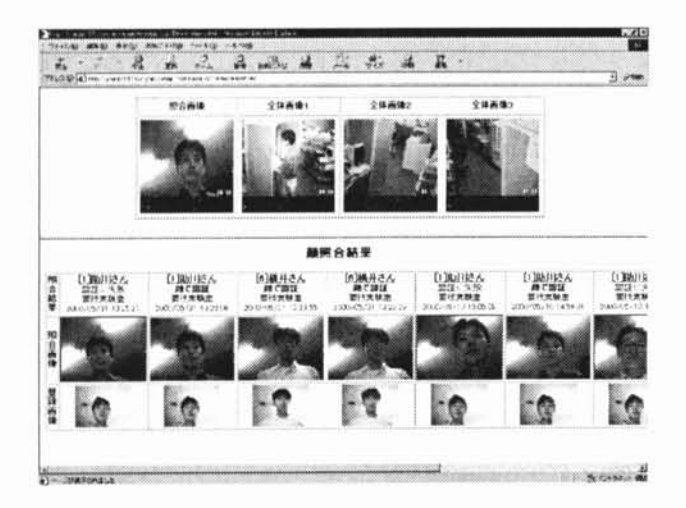
Figure 4: A screen-shot image of remote monitoring. Video monitoring (upper) and face recognition results (lower).

common dictionary data can be distributed to the terminals.