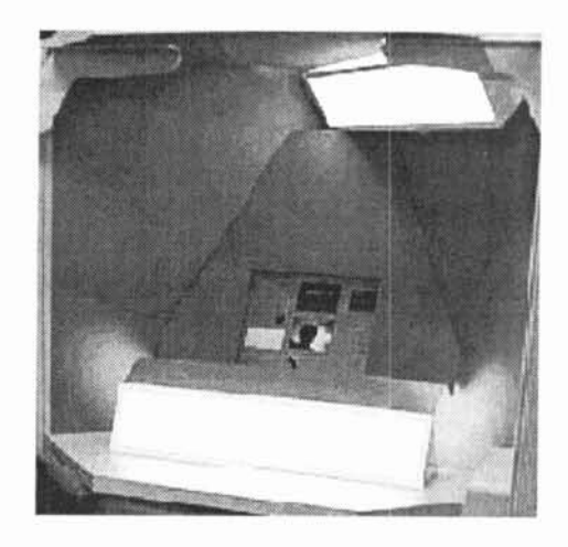
Figure 2: Face recognition terminal

Wireless memory cards and a reader are associated with the terminal to perform contact-less verification. The terminal receives an ID of wireless memory card and prepare one of the dictionary data for each individual. According to the recognition results, the PC sends a command to the door-control device