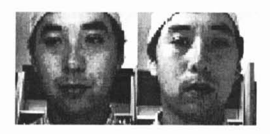
Figure 1: Effects of lamps. Without lamps (left) and using an upper-right lamp and a lower lamp(right).

Figure 1 shows an image captured using the upper-right and the lower lamps. The upper-right lamp makes the right side of a face image with shading and the left side of an image without shading. The right side represents plane face features and the left side represents three-dimensional features of a face. Although, a face pattern is symmetry and includes redundant data, this lighting apparatus makes input images unsymmetrical and significant.